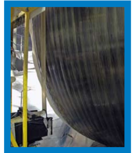
Vipel® K022-AC vinyl ester provides a user-friendly processing window.