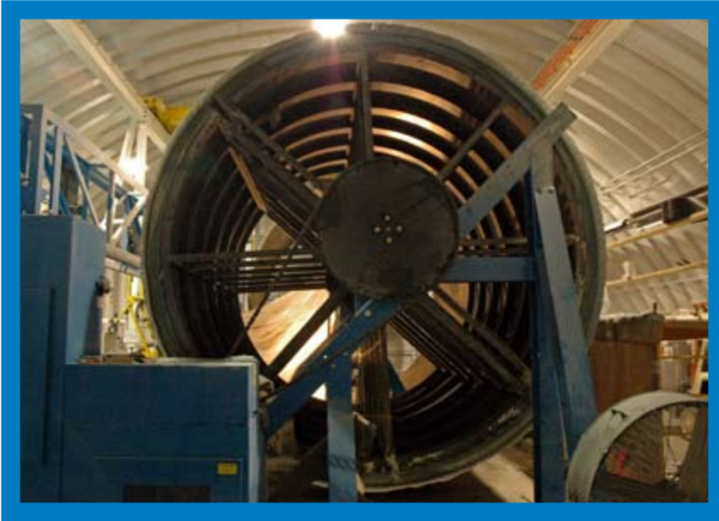
Tri-Clor's state-of-the-art facility can manufacture a variety of corrosion-resistant composite applications.