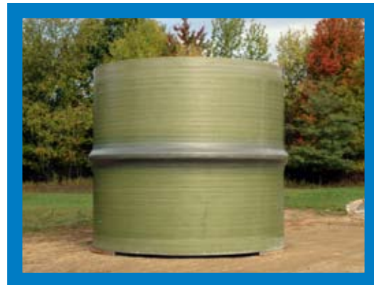
The 13.5-foot tall by 15-foot diameter liner cans were shipped from Tri-Clor facility.

Tri-Clor added a layer of urethane foam, which was then encapsulated between the initial 14-foot (4.3-meter) cylinder and an outer layer of additional filament wound composite.